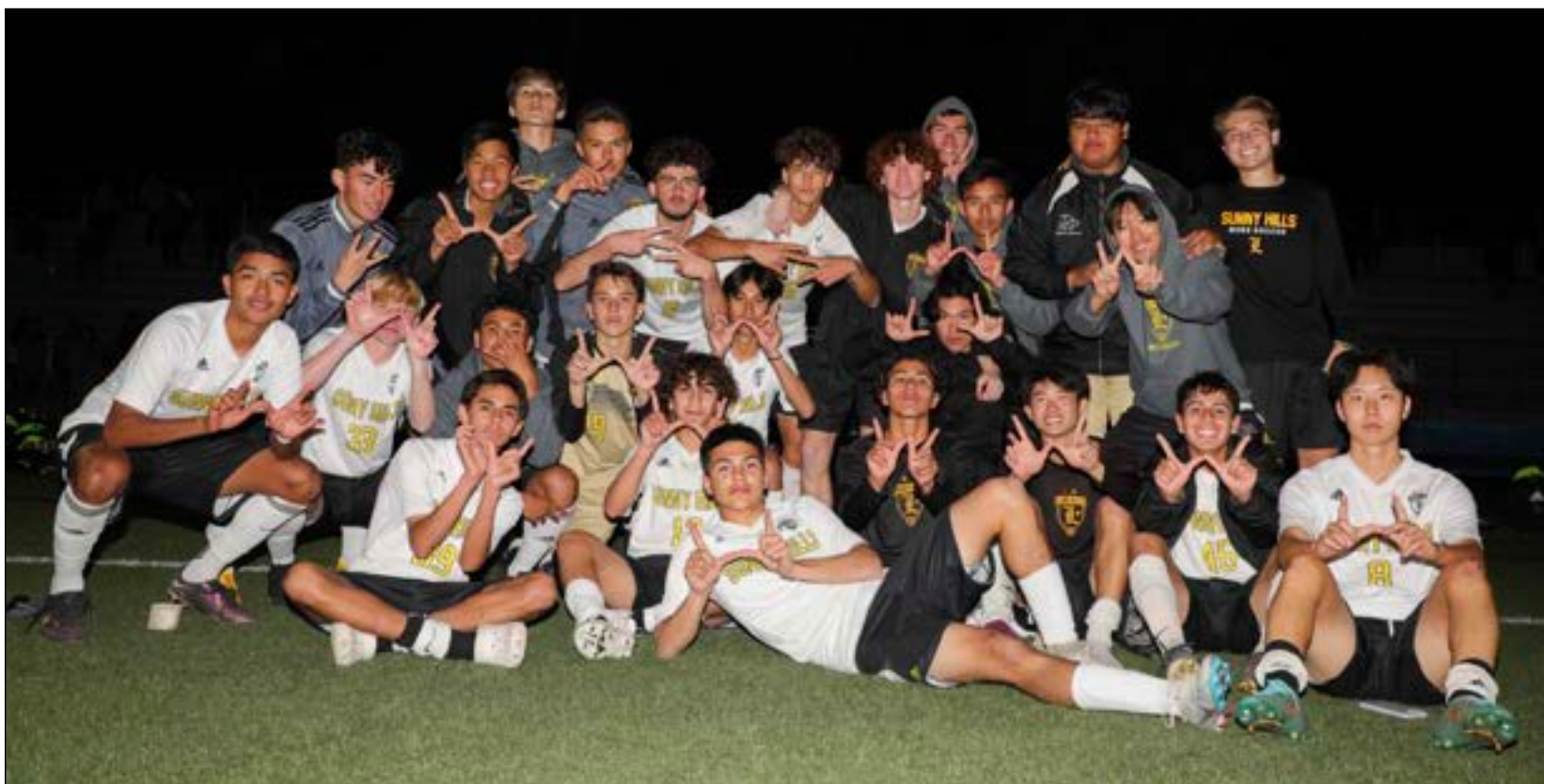
"DUBS" ALL DAY: The boys soccer team poses with "W" signs to represent its CIF-SS Division 1 semifinal win against the Citrus Hill Hawks on Feb. 18 at Citrus Hill High School.