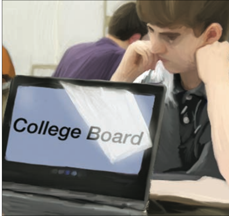
ELISA ARIAS | theaccolade

With the exception of the AP Art and Design courses, the exams include a section of open-ended, essay questions for students to complete; however, responding to these lengthy questions by hand often impairs a test-taker's ability to complete all the questions because of