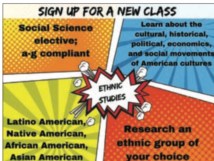
Image printed with permission from Hera Kwon INTERESTED?: A flyer in students' registration envelopes promotes the new Ethnic Studies class.